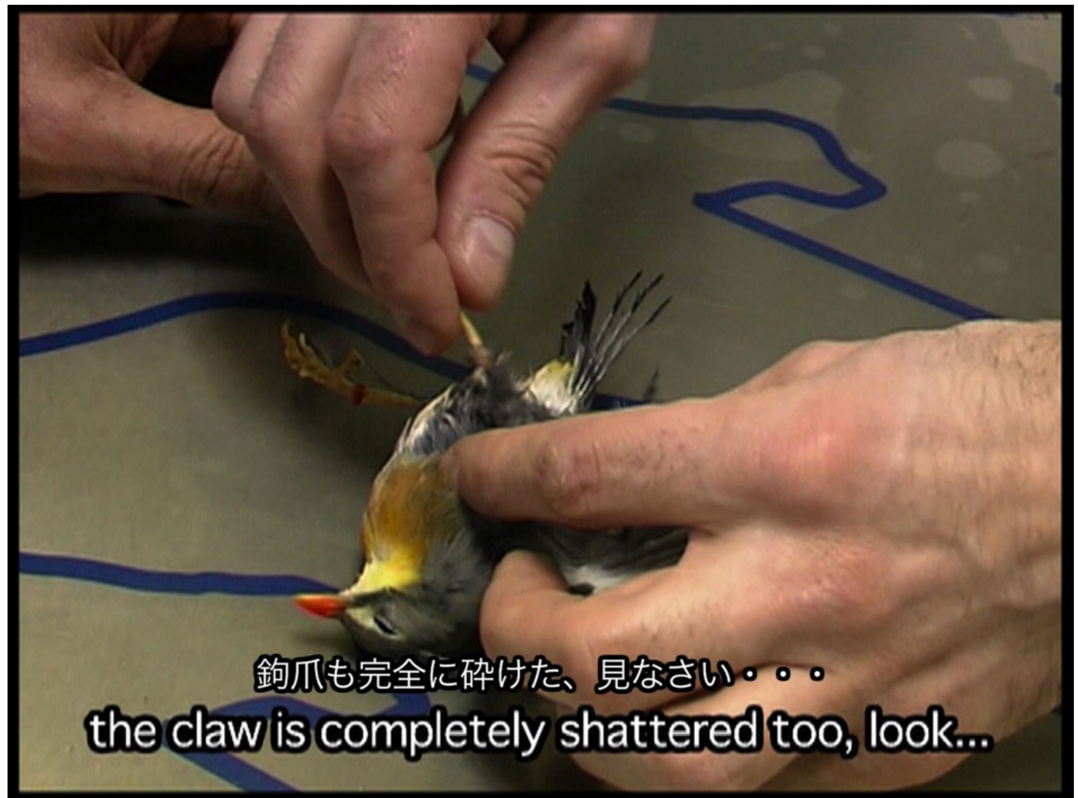
Video Still - RVB Version 3 screen , August 2004

RVB premiered at the Centre Culturel Irlandais in Paris in March 2004. and received the Open EV+A 2005 award in March 2005.